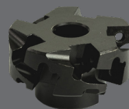
Milling head Code: B60.0027