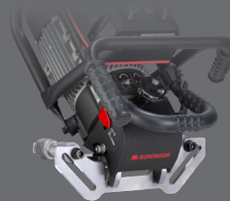
Stainless steel guide plate assembly Code: B60.1020S